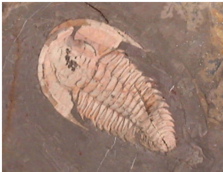
Trilobite Redlichia takoensis

On Kangaroo Island, thieves illegally used explosives to blow out a volume of rock the size of a small car from a cliff face which they split on the beach.