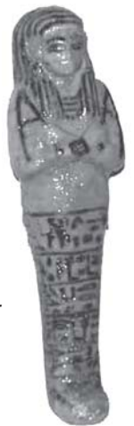
This magic "robot" was thought to come alive in the after-life to be your servant.