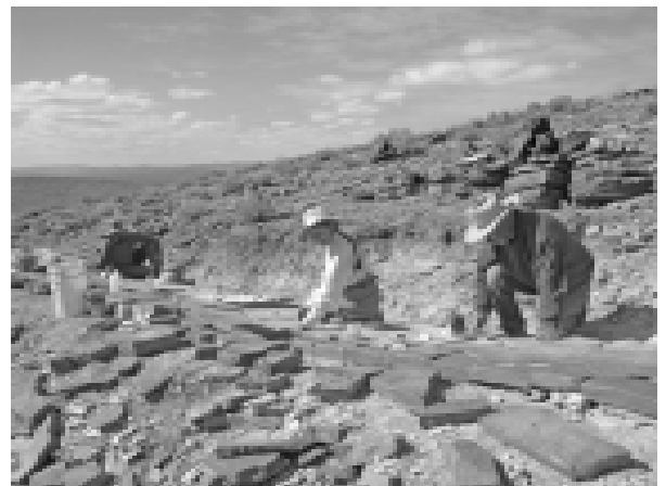
Digging out the fossils takes a lot of effort.