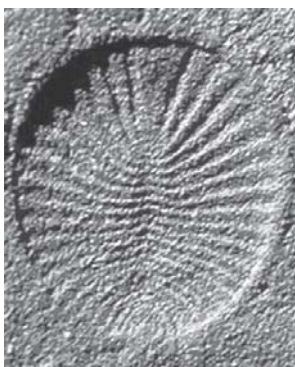
Dickinsonia was probably a soft animal that slid along the sea floor.

Can you find the answers to the multiple choice questions in your Museum Record book?