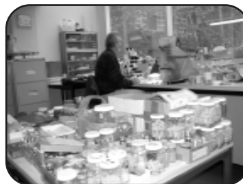
A small part of the marine invertebrate collection.