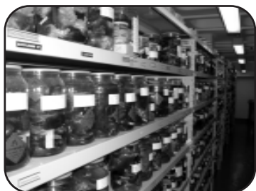
Many fish, reptiles and mammals are kept safe from decay in alcohol.

Talk about what the display is about and record the most important ideas as dot points in your Museum Record book.